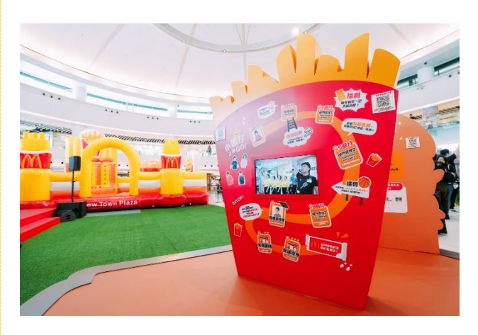
Interesting interactive exhibitions are set up where visitors can play games and learn more about McDonald's.